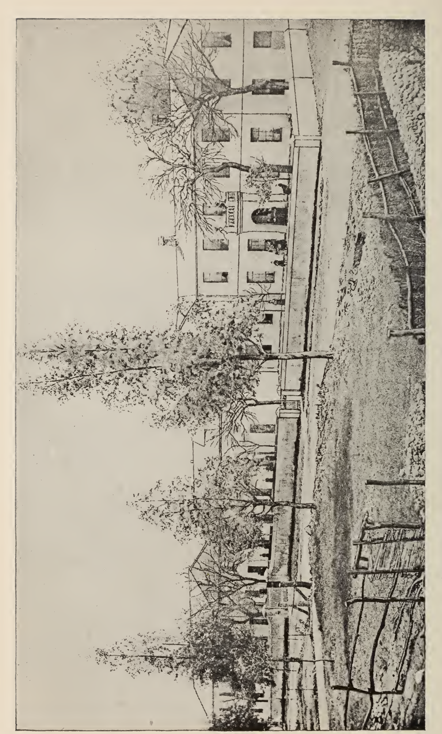
THE HUGUENOT FEMALE SEMINARY, WELLINGTON, CAPE COLONY, SOUTH AFRICA.